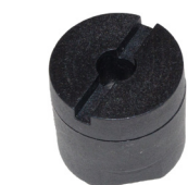
DS1922F Autoclave Datalogger