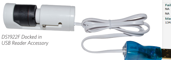
DS1922F Docked in USB Reader Accessory